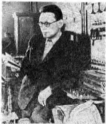
20 M. Botvinnik in the laboratory